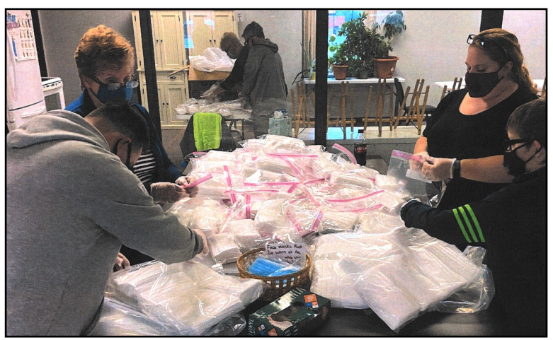
Below: FiveCAP food distribution boxed up and ready with packages of masks in each food box.

Below: Manistee Friendship Society volunteers packaging masks for Feeding America Mobile Food Pantry participants.