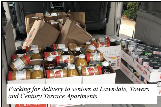
Packing for delivery to seniors at Lawndale, Towers and Century Terrace Apartments.