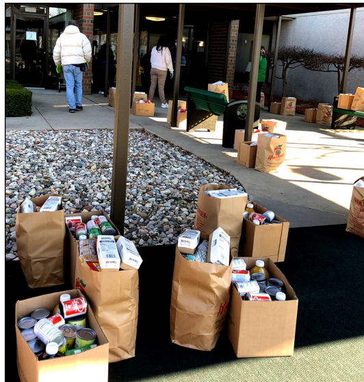
Thank you to the following volunteers that helped with the CSFP food distribution: