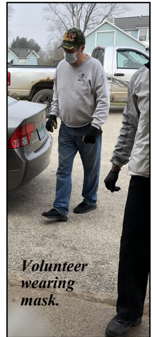
Volunteer wearing mask.