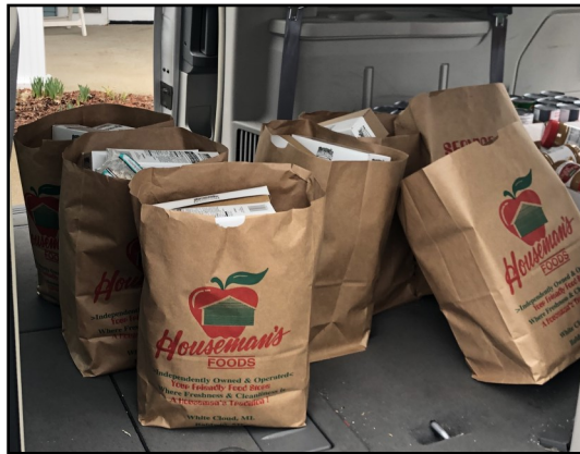
Below: Food set up for seniors Ludington Towers Apartments. Food delivered outside and set out for individual seniors to pick up.

Distribution modifications included asking seniors to remain in their car, with name checked off list and food brought to the car. Participation was up slightly from prior distribution. Special thanks to volunteers!!