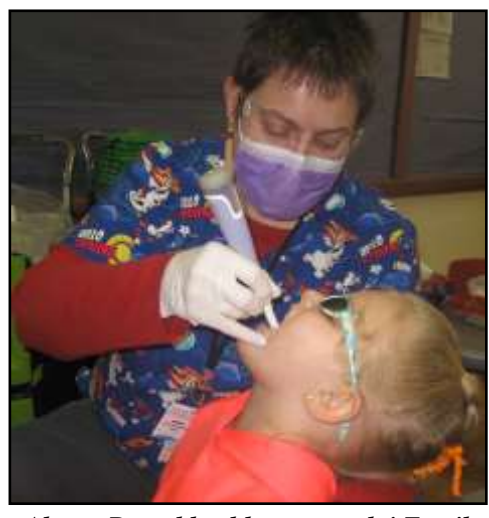
Above: Dental health starts early! Family Health Care providing dental exam services at a FiveCAP Head Start Center.