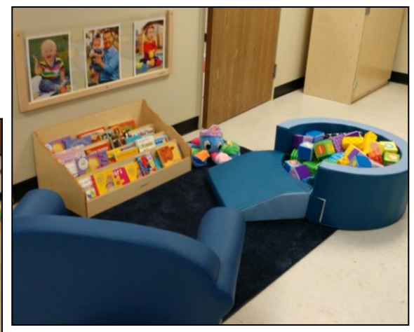
Pictured : Early Head Start classrooms set up and ready.